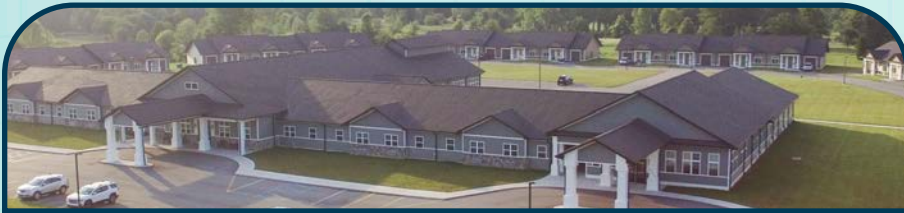
#1 Senior Living Community & #2 Assisted Living Facility The Heartlands

Thank you to our community for all of the support and voting many of our providers and locations as your favorite in the county!