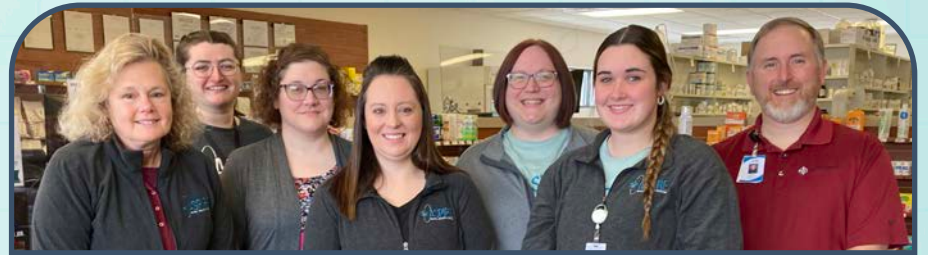
#1 Pharmacy Hospital Drive Pharmacy